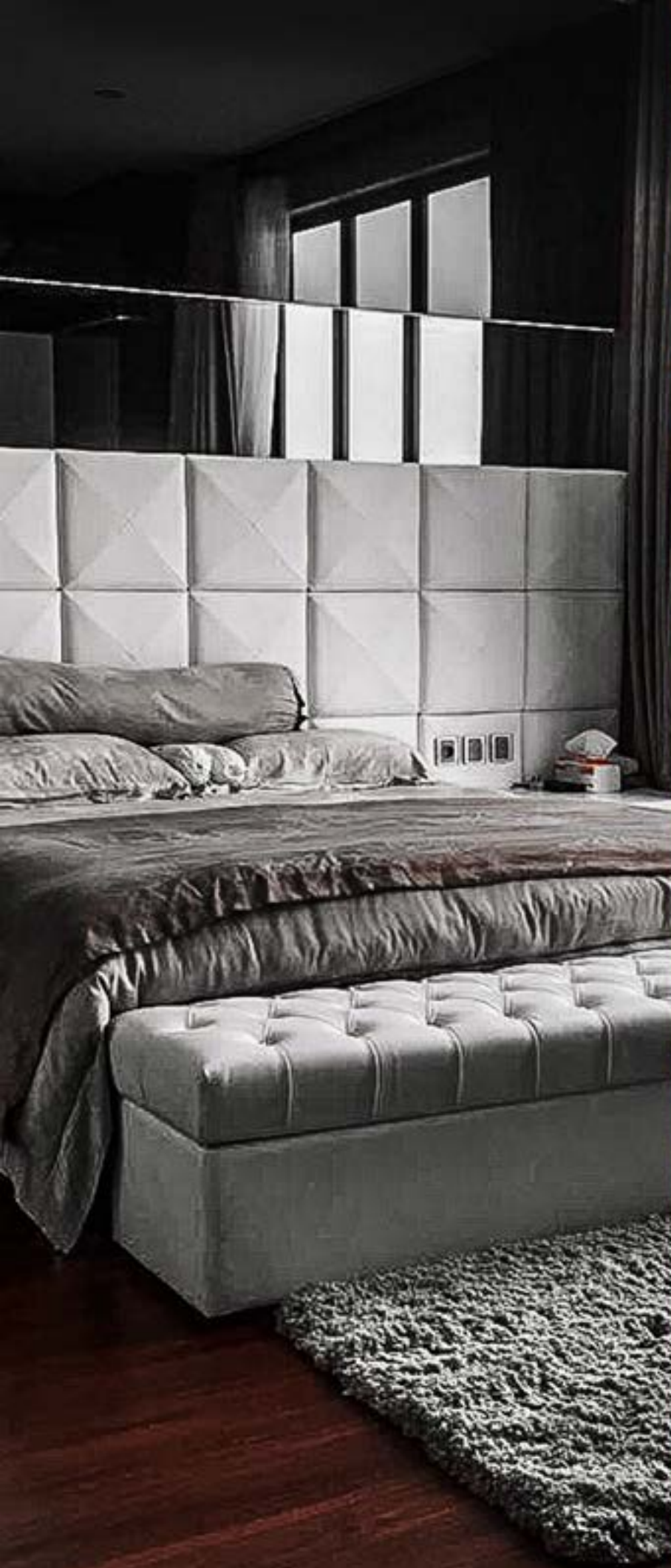
MERBAU COUNTRY F 2655 PARKIT FERGIO | SMALL EMBOOST